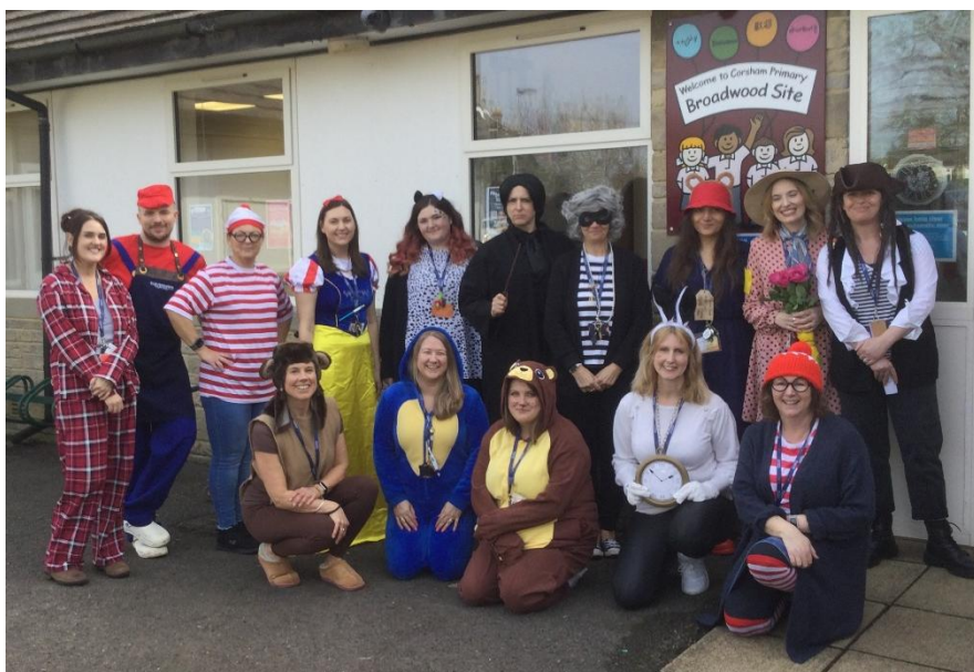
Support staff at Broadwood