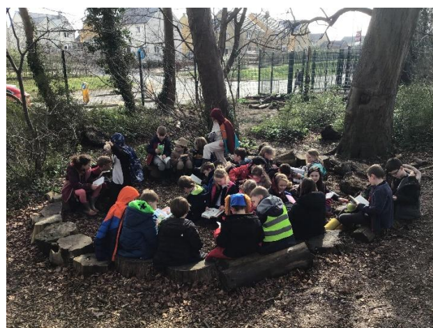
3/4B enjoying some outdoor reading